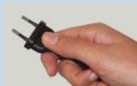
1. Plug in