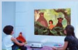
3. Big picture out

Play DVD/DivX, MP3 music or audio CD, digital pictures directly from CD or USB memory devices, or connect your TV or PC with this integrated projector, DVD player and two speaker surround sound system.