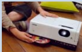
2. DVD in